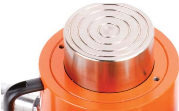
Splined plunger, no saddle needed