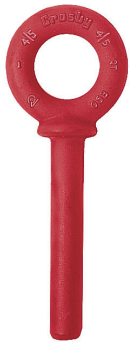
S-276 Shoulder Rivet Eye Bolt