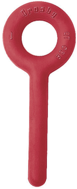
S-293 Rivet Eye Bolt