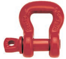
S-253 SCREW PIN SLING SHACKLE