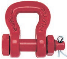
S-252 BOLT TYPE SLING SHACKLE